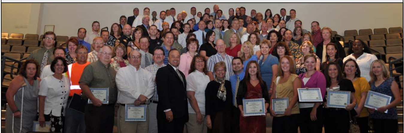
2009 CPM Graduates