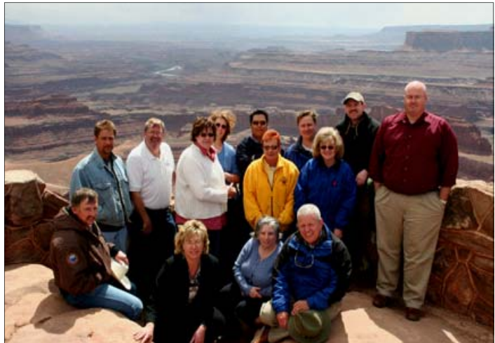
Students from Moab Course 3, at Deadhorse Point State Park—Winter 2005

Creating clear direction, efficiency, timely response, and quality outcomes are necessary competencies for project managers. In this capstone module students apply comprehensive knowledge and skills by participating in a team-based process improvement project chartered by a public organization. Students utilize the processes and principles of project planning and management, and exercise tools and techniques to establish roles and responsibilities, define activities, develop schedules, manage resources, track progress, and evaluate results. Students employ problem-solving and data-gathering methods to help an organization identify viable change strategies. Students examine change and transition issues impacting organizational structures and culture. Students compile publishable documentation and conduct a formal presentation on project results.