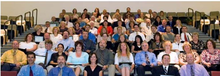
Certified Public Manager® 2007 Graduates